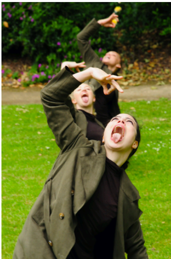
REMEMBRANCES - Birmingham 2022 Festival

Trustees' Report and Accounts For the Financial Year Ended 31 st March 2023