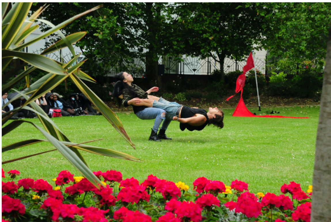
REMEMBRANCES - Birmingham 2022

Related to ORIGINS but separately commissioned, REMEMBRANCES was our first live performance presentation since before the pandemic, carefully placed in an outdoor setting during the summer to reduce any ongoing risk. The piece was co-produced by Border Crossings' ORIGINS Festival, AVA DANCE COMPANY and b.solomon//ELECTRIC MOOSE (Canada). It was presented as part of Birmingham International Dance Festival 2022, produced by FABRIC. Commissioned as part of the Birmingham 2022 Festival, generously supported by Arts Council England, BDF, the Canada Council for the Arts and the High Commission of Canada in the United Kingdom. The commission from Birmingham 2022 was a particularly significant one for Border Crossings, as it placed the company's work at the centre of national and international debates around key questions of cross-cultural relationships in the period of decolonisation.