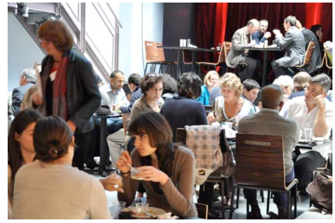
The Forum adjourned for a Moroccan lunch.